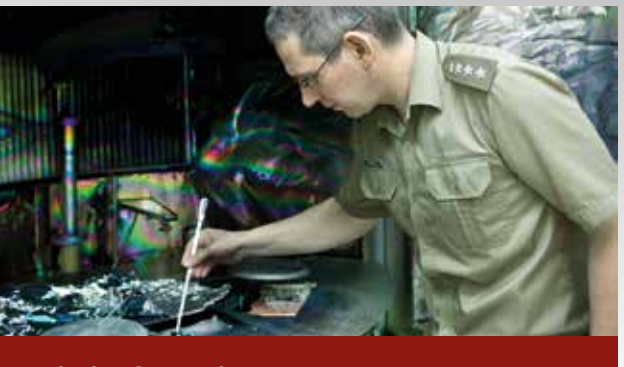
Fabrication of plasmonic nanostrucctures by PVD